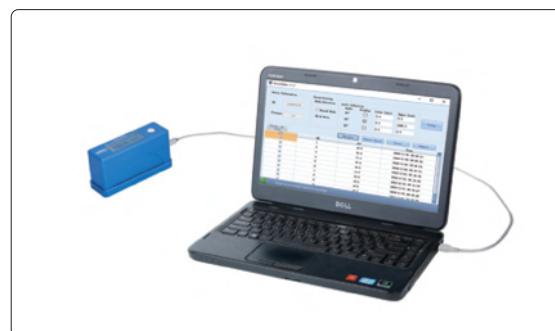
connect to computer via USB cable