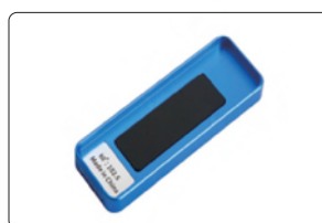
base with calibration block (included)